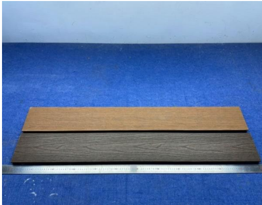
Front view & Back view