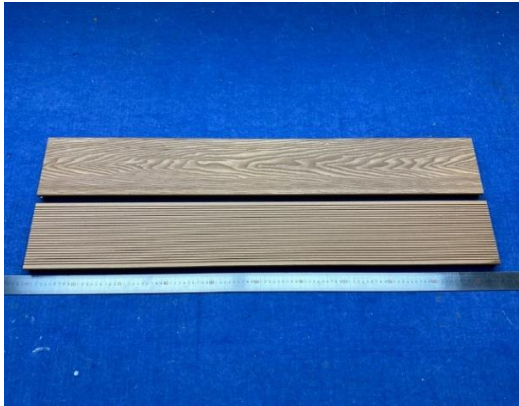
Front view & Back view